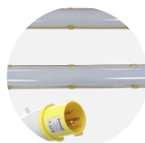
Lighting Kit FRLK-110