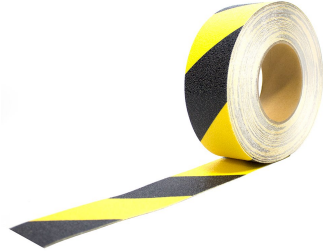
Yellow / Black