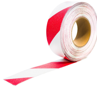
Red / White