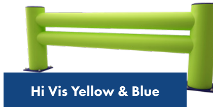
Hi Vis Yellow & Blue