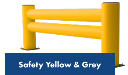
Safety Yellow & Grey