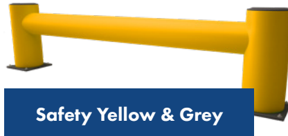
Safety Yellow & Grey