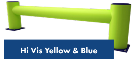
Hi Vis Yellow & Blue