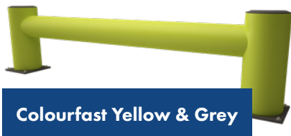
Colourfast Yellow & Grey